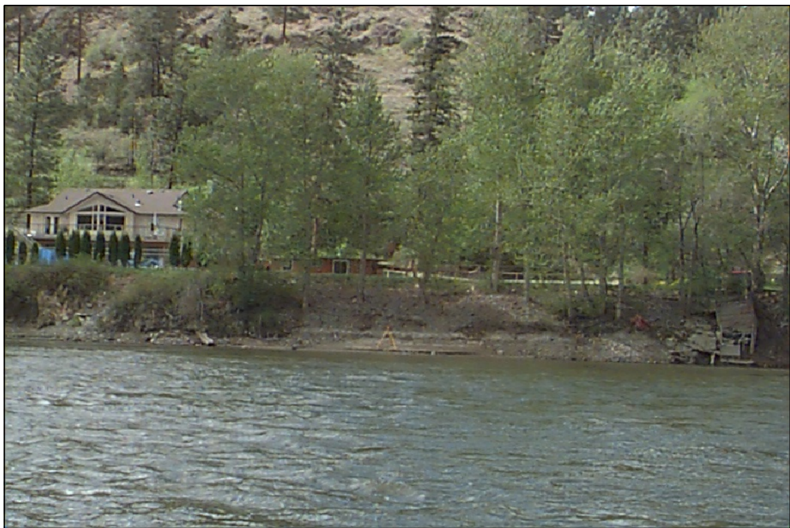
RIGHT BANK VIEW