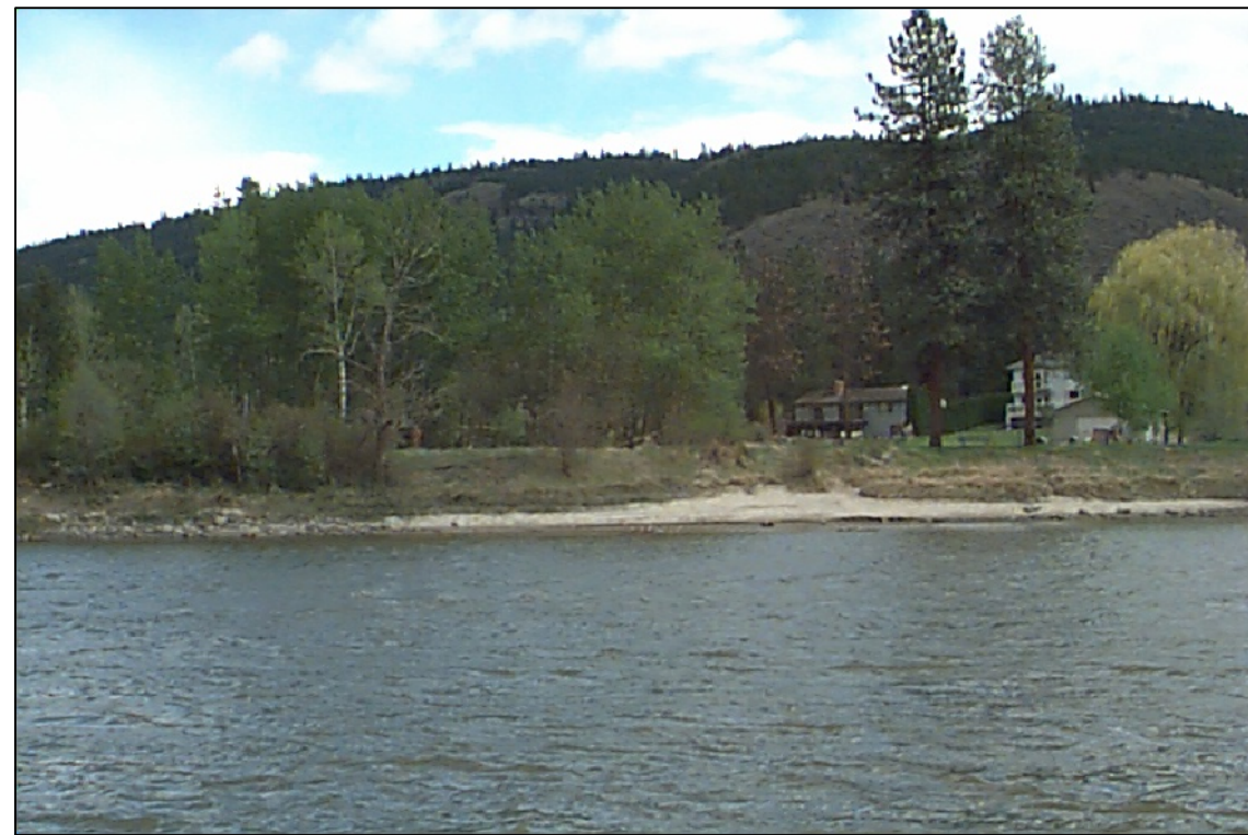
LEFT BANK VIEW